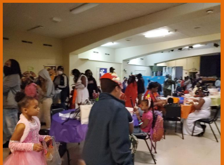
Children and their adults thronged Wesley Hall for the Halloween Carnival on October 31.

Our world leaders The people of Ukraine, and those all around the world, affected by war