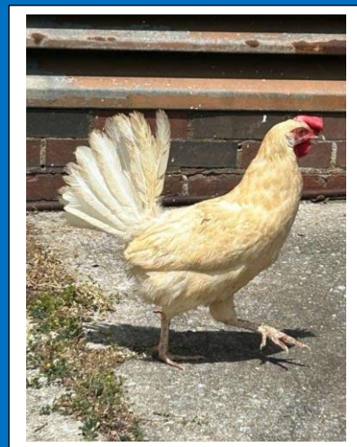
Until recently, we had a church chicken!